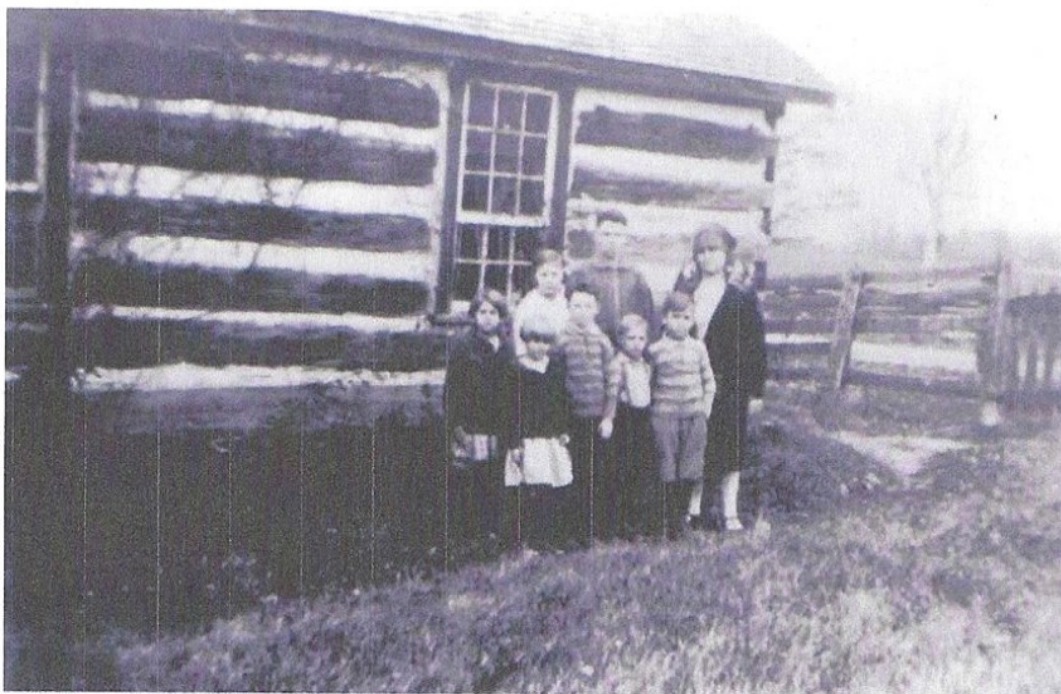
Sandy Lake School about 1928

In 1941 the original woodshed, which was built at the same time as the first school, was replaced by a new one.