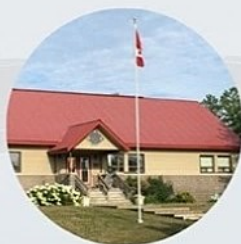
Cavendish Community Hall