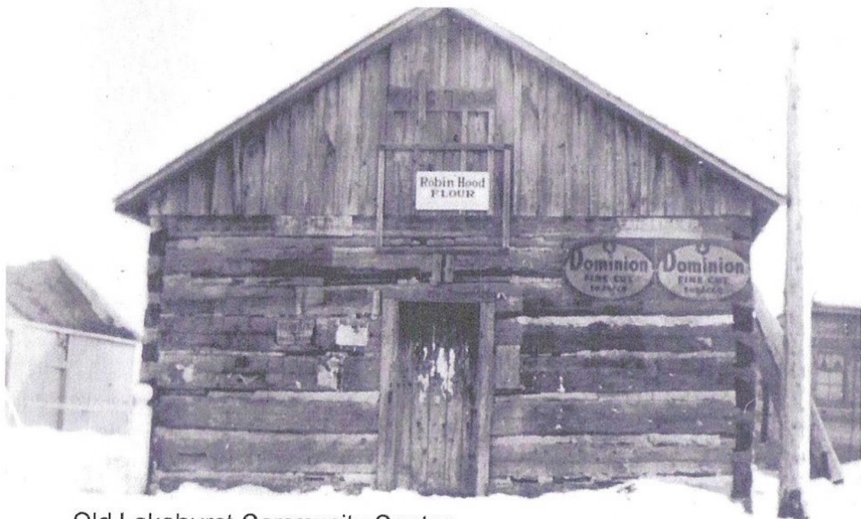
Old Lakehurst Community Center