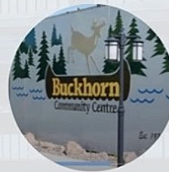
Buckhorn Community Centre