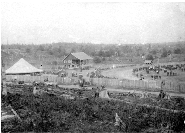
Kinmount Fair sure has changed in 113 years!!